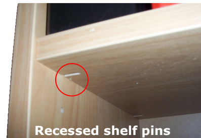
Recessed shelf pins

eXtraordinary! Not an ordinary bookcase.