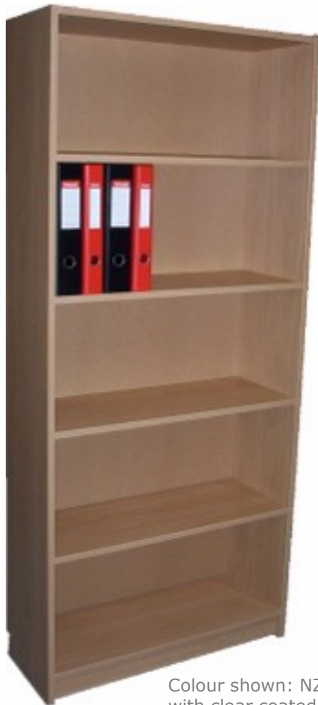
Colour shown: NZ Tawa with clear coated back

Stationery, Furniture, Equipment, Computer Accessories & Supplies