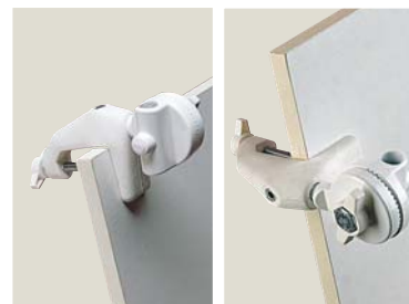
Showing LSM-1 fitting on top and side of drawing board

LSM-5 Swivel bracket with mounting stud and nut.